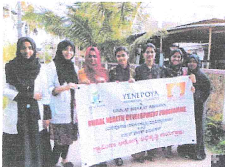
Group photographs of activity in the villages