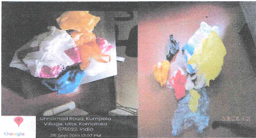
Collection of plastic bags