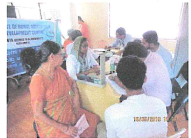
Pulmonary Medicine outreach camp